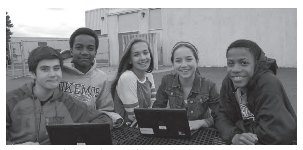
Chippewa students using their new Personal Learning Devices