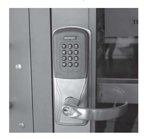
New interior and exterior door locks for our schools.

In the case of an emergency, the newly expanded security system will help outside agencies manage the situation. Further, we have enhanced our ability to communicate