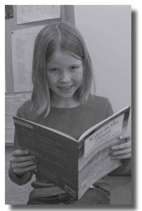
OPM student enjoying one of the non-fiction titles purchased with an OEF Grant this year.