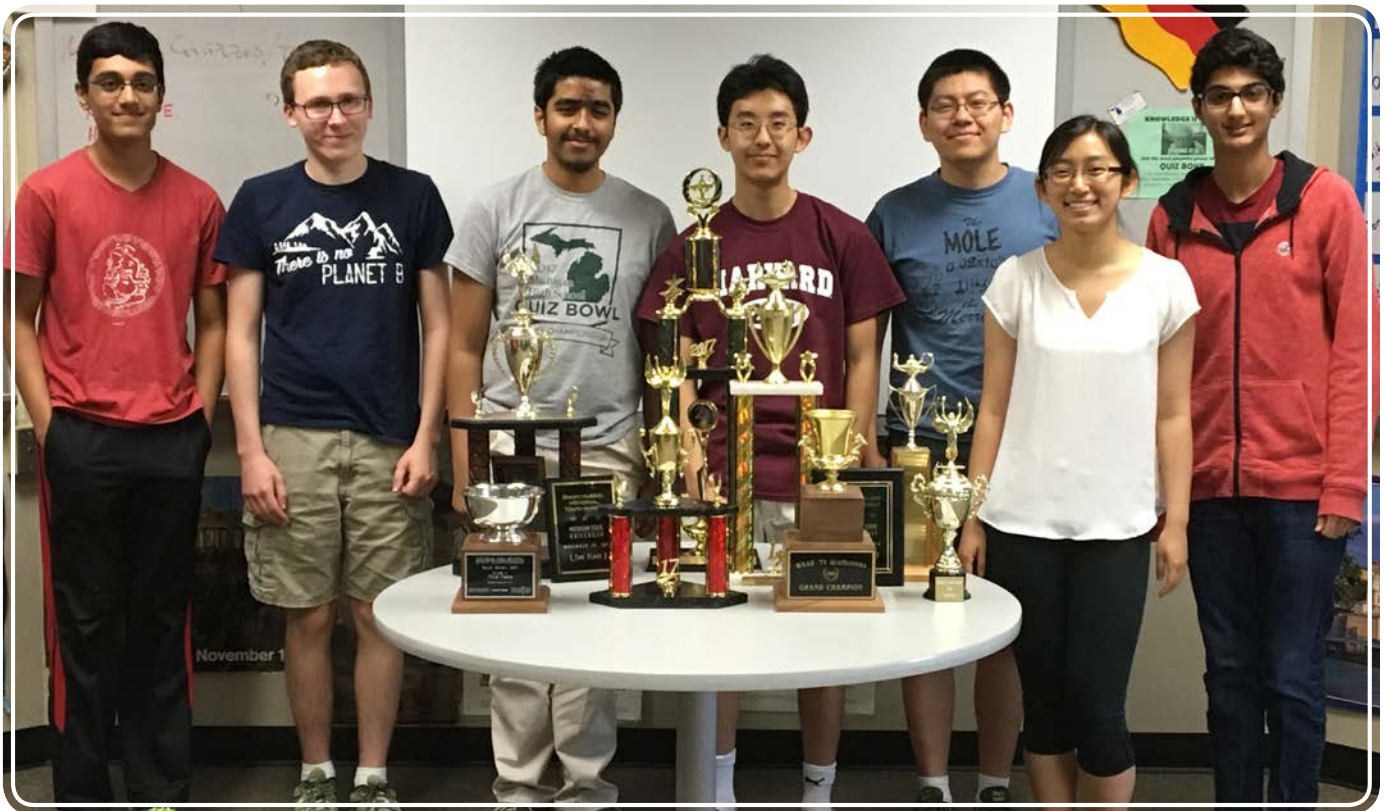
OHS Quiz Bowl's 2016-17 varsity team