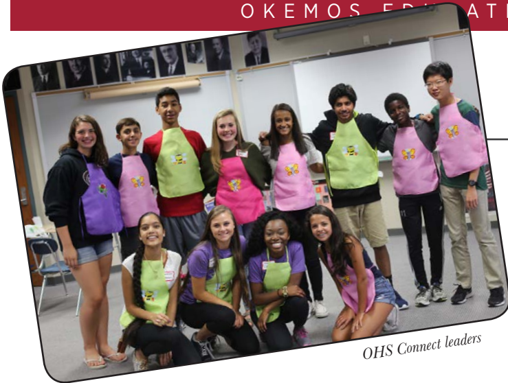
OHS Connect leaders