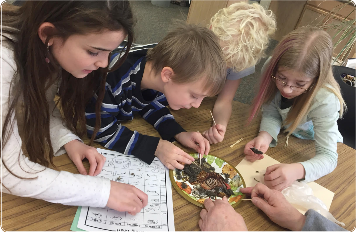
Montessori at Central: Students learn about animal structure