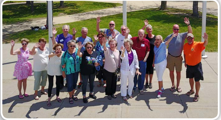
Class of 1967 Reunion

Log onto www.OkemosAlumni.org and take a look at all it has to offer. There are several projects in the works to create biographies of noted graduates for the Alumni Hall of Fame to honor Okemos alumni who have made significant contributions. Through the Okemos Alumni Association, you can enjoy the history, contribute to the history, and donate to the school. If you are an Okemos alum, please reach out. We’d like to hear from you and we welcome you to share your memories with others.